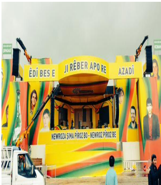
Foto: Newroz 2015 Diyarbakir-Amed

Long live the fraternity of all peoples!